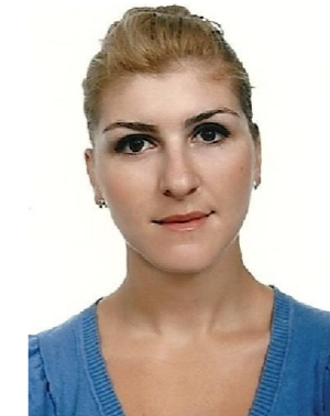
Orgocka Holta Average mark 70.11 Albania Thessaloniki group